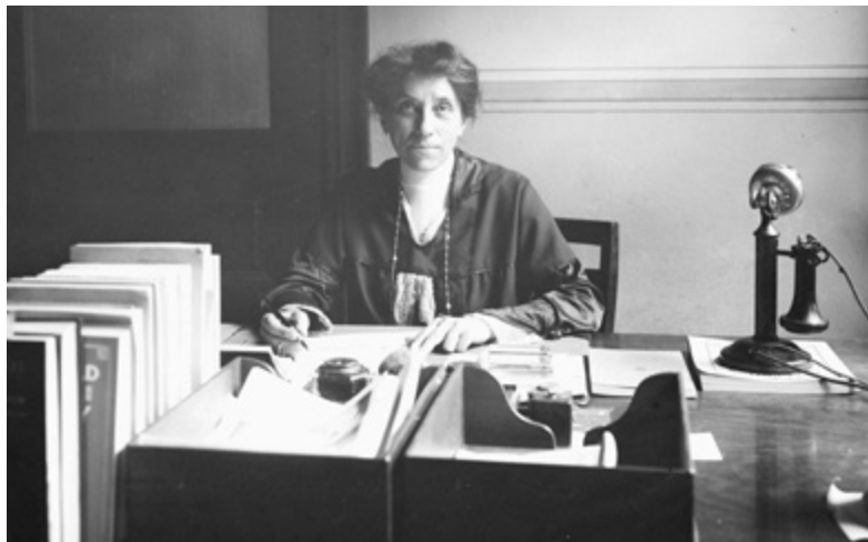
Library of Congress, LC-DIG-npcc-31704

47. Opponents of the Sheppard-Towner Act successfully brought about its demise in 1929, but the Montana legislature, in anticipation of the cessation of the act, approved an allocation of $18,800 in state funds. Operating with a 25 percent budget cut, the Child Welfare