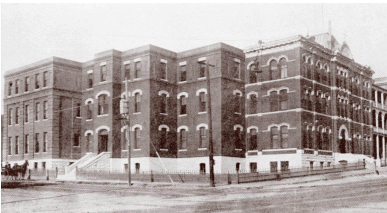
MHS Photograph Archives, 946-103