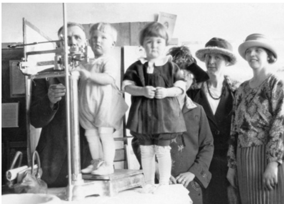
MHS Photograph Archives, Lot 30 B2 F9 01

The Sheppard-Towner Act provided federal funds to states that allocated additional monies to support education, training, and the provision of sterile birthing supplies to childbearing women. The Montana legislature earmarked $1,238 for fiscal year 1922 and $8,702 for the year ending June 1923,