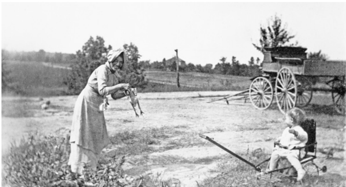
MHS Photograph Archives, PAC 82-3-3

informal delivery attendants had knowledge of and implemented high standards of cleanliness. Sanitary agents such as Lysol, boric acid, and carbolic acid topped the list of products used by birth assistants. Children's Bureau staff noted that homesteading birth attendants "realize[d] their limitations, and