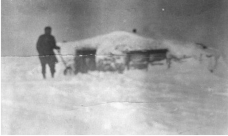
A fierce snowstorm engulfs a Richland County homestead in 1910. Women delivered in shacks like this one, and the combination of frequent blizzards and poor roads often made travel out of the question. Without ready access to delivery assistance, some women gave birth entirely alone or with only their husbands in attendance.

information-gathering accuracy, the maternal mortality rate in Montana did not decrease at all, but instead rose precipitously. 49