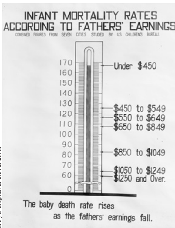
The Children’s Bureau compiled statistics that linked infant mortality to poverty—not parental race or class. The Bureau published these posters in 1916.

While Euro-American immigrant women often chose to forego prenatal medical care, they rarely chose to give birth alone. Women planned for and depended on the presence and support of other women whenever possible. The Children’s Bureau study, one of the few statistical resources available, counted the total deliveries in a Montana county from 1912 through 1917. Over the course of the study, 13 percent of births occurred with just the mother and father present. Only a few births, 1 percent, took place without any assistance at all. Those women who delivered alone did so as a result of conspiring circumstances—sometimes the baby’s father left to fetch the doctor and neither father nor doctor returned in time, or the mother delivered unexpectedly early.