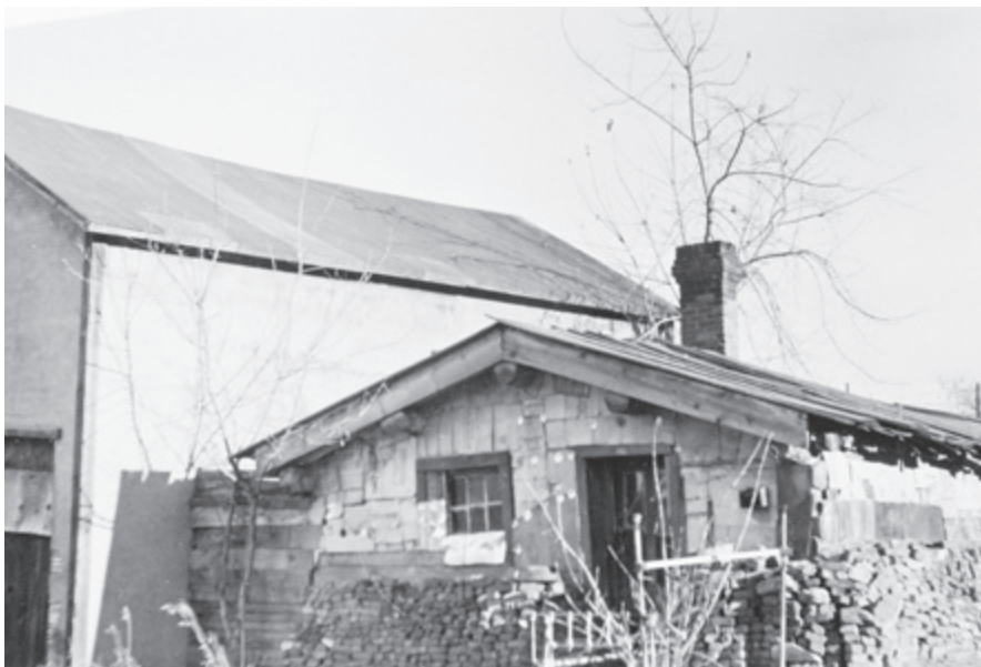
MHS Photograph Archives, 953-518

Early hospitals were often small and unassuming and were sometimes housed in former residences. The Miners Hospital in Helena (original site pictured at right) opened in 1866 and was representative of early medical institutions. Over the years, hospital facilities, such as the St. James Hospital in Butte (below), expanded and established a significant presence in urban areas.