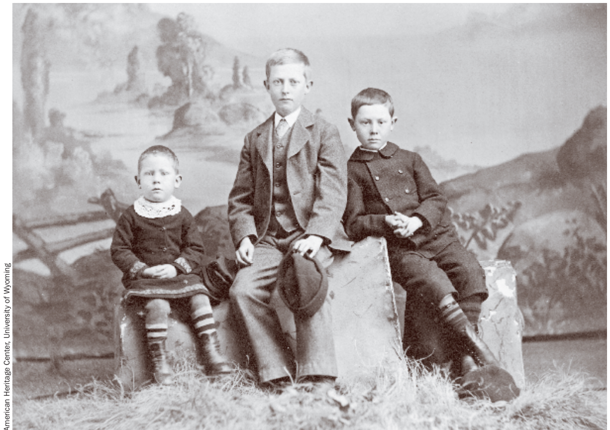
American Heritage Center, University of Wyoming

Euro-American women entered the American West during all stages of the western migration. Living