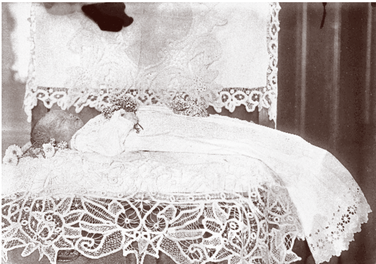
The Montana State Board of Health reported that nearly nine thousand women and infants died during childbirth from 1911 through 1919—a staggering toll. Photographer Evelyn Cameron documented one small life lost near Terry, Montana, circa 1911. Families grieved the death of infants and often referred to them in diaries and correspondence, remembering their passing even years later.

they proudly reported in 1909, “Only two States show a death rate lower than in Montana.” 32