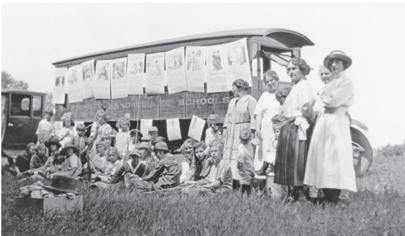
The Montana legislature created the Child Welfare Division in 1917. The division oversaw public health nurses across the state, worked with local women's organizations, and created educational exhibits, which it loaned out for conferences, fairs, and schools. The posters on display at this Stockett and Sand Coulee school gathering gave information about "care after birth," "development through exercise," "prenatal care benefits the child," "prenatal care saves the mother," "the expectant mother needs," and "when the baby comes."