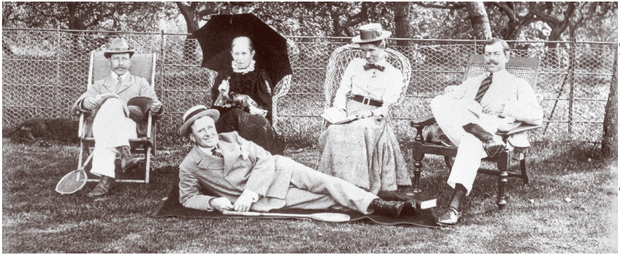
Evelyn Cameron, photographer, MHS Photograph Archives, Helena, Pac 90-87 vintage