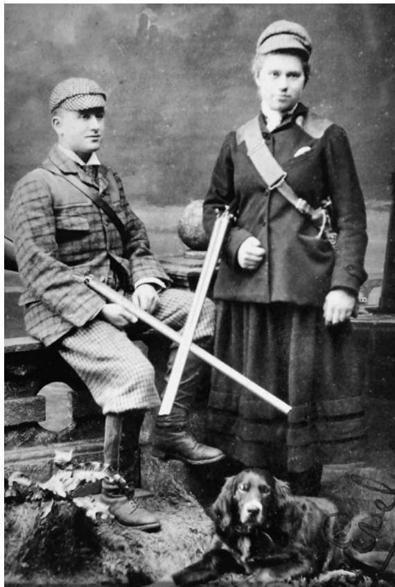
Flower Family Papers