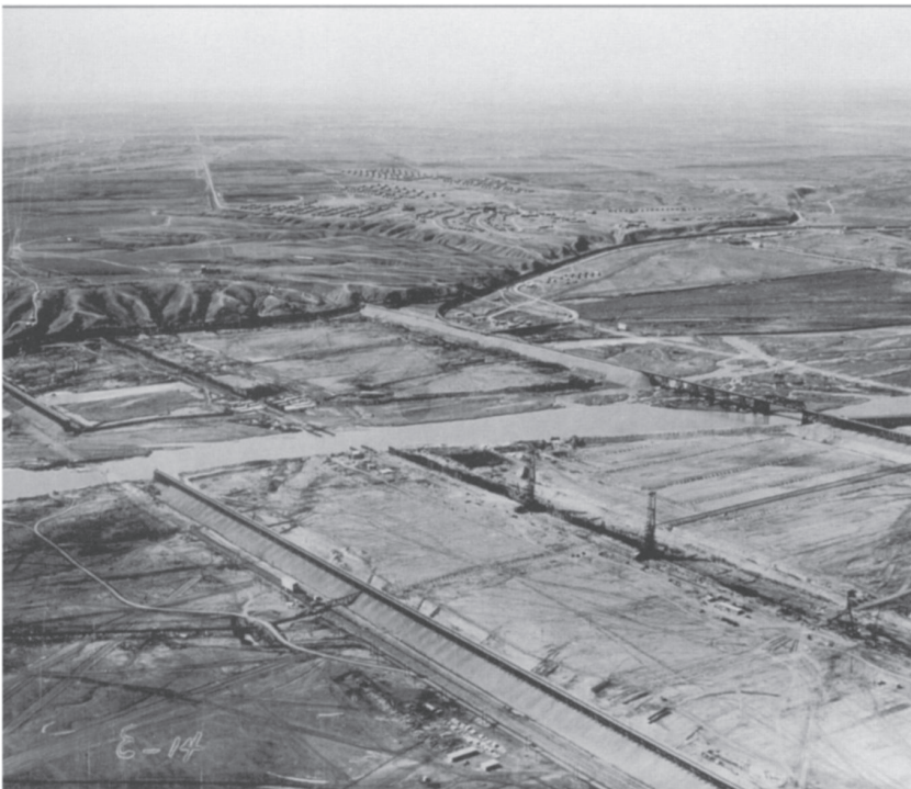
Fort Peck Dam construction, circa 1934: The railroad on its pile trestles and steel bridge across the Missouri River almost completely surround the area to be filled with more than 130 million cubic yards of earth, gravel, and rock. The town of Fort Peck is shown on the bench above the dam site at top.

I saw the small fruit farms in the Valley of the Rio Grande; the peppers, and corn that hang upon the walls of the homes in sunny New Mexico. I saw an old, old church built of adobe bricks that has walls as thick as a fortress. It took seventy-five years to build it, and it stood without repairs for over four hundred years. . . . I saw the women sweep their dirt floors with wisps of hay. I saw the tortillas, the outdoor ovens, the thick black hair on the heads of the children, and the blond heads and olive skins of the Castilians. 23