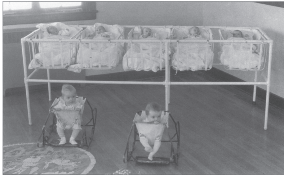
Florence Crittenton Home, Helena, Montana