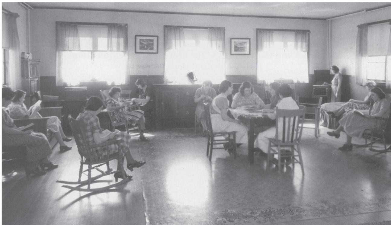
Florence Crittenton Home, Helena, Montana

Helena Florence Crittenton Home residents lived under strict rules of conduct, especially in the 1930s when “parental emphasis” characterized the home’s atmosphere.