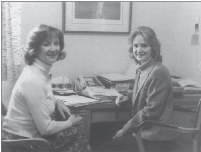
Florence Crittenton Home, Helena, Montana