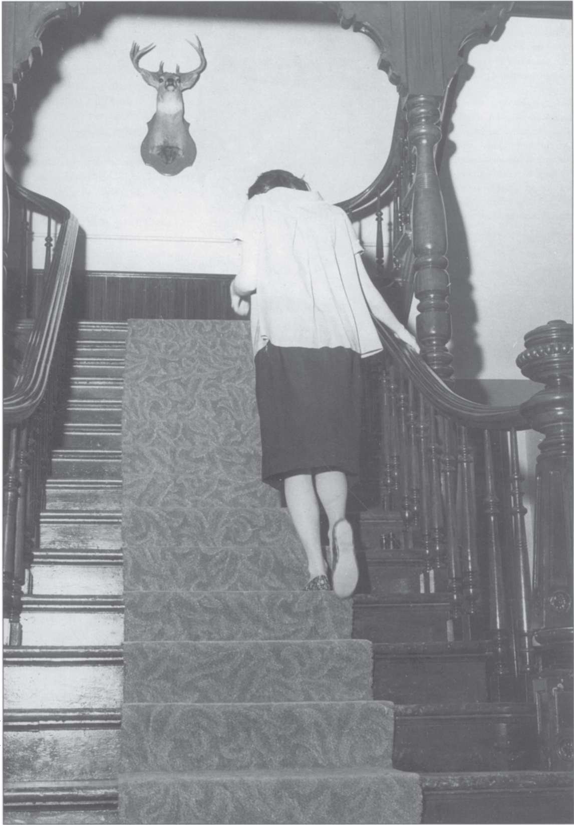
Florence Crittenton Home, Helena, Montana