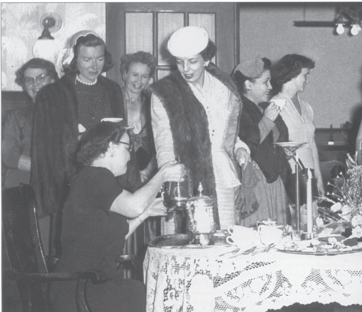
Florence Crittenton Home Circles formed around the state to assist with referrals from their communities and to raise money to pay for maternity fees and other expenses. In the early years of the Helena Florence Crittenton Home, Helena's home circle organized a Harvest Shower to provide needed household goods; later the annual Silver Tea replaced the fall event. The home circle members above gathered circa 1950 when the home was located at 22 Jefferson Street.