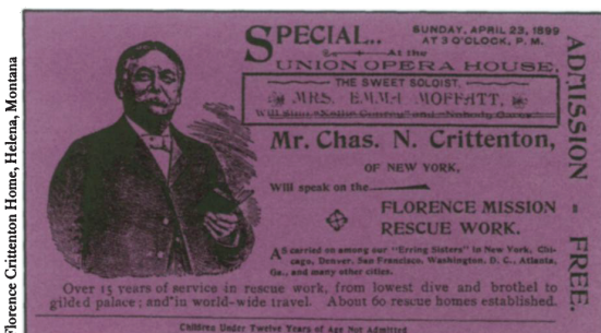
Florence Crittenton Home, Helena, Montana

Helena Florence Crittenton Home residents lived under strict rules of conduct, especially in the 1930s when “parental emphasis” characterized the home’s atmosphere.