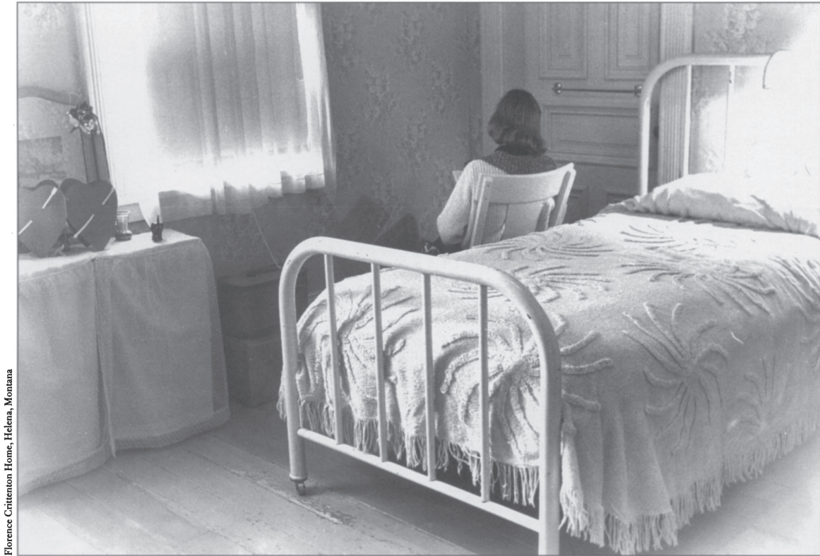
Florence Crittenton Home, Helena, Montana

Anonymity and privacy was, and is, a Crittenton priority, as this photograph from the archives of the Helena Florence Crittenton Home demonstrates.