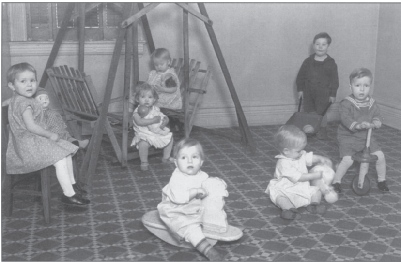
Early days at 22 Jefferson.

Florence Crittenton Mission strongly advocated that mothers keep their babies, and most followed this recommendation. The matron wrote of a fifteen-year-old from a small community in western Montana in 1905: "Looks much younger. Is pregnant and will stay six months. The mother supports the family by working and the children have little care or training. . . . The mother is not able to pay anything." A few months later the teen went home to her mother with her newborn. The matron noted, "Willing to