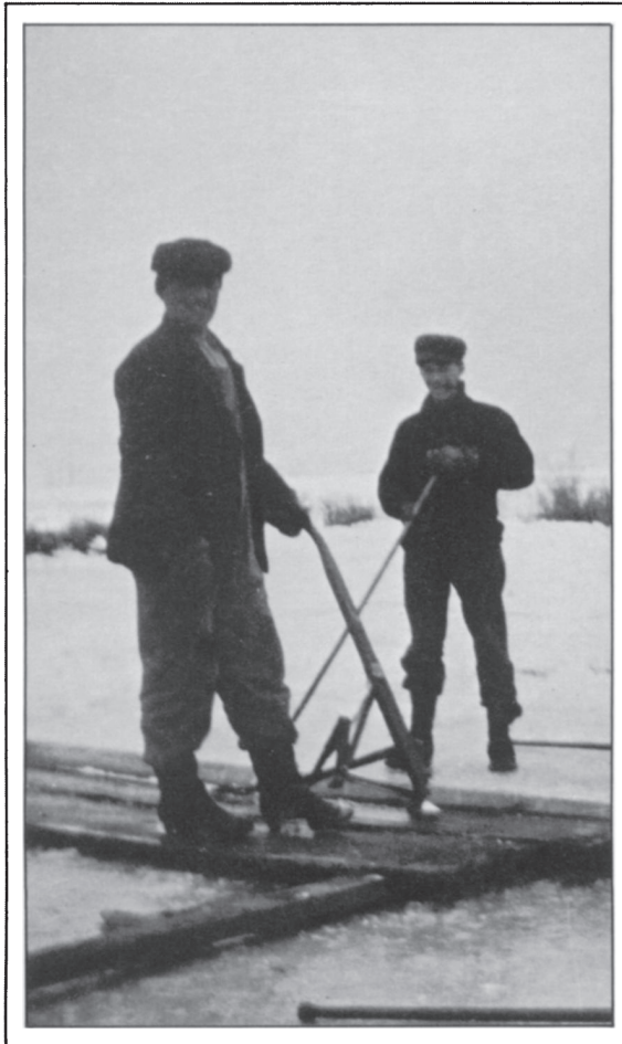
These workers, using pike poles and splitting forks, moved the sheets of ice and split them into blocks before they were dragged on sledges to the storage shed.

Because icing the fruit trains was a large part of Marguerite’s business, she should have benefited from the improved freight service and the increasing demand from the East Coast. But she was still stymied by the division superintendent and hassled by the railway section boss.