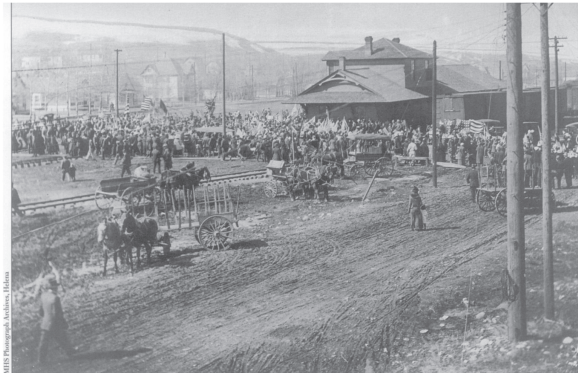
By 1910 three-quarters of Red Lodge's population were immigrants or the children of immigrants who settled in their own distinctive neighborhoods and often spoke little English. When the United States went to war in 1917, many of them came under attack for not being "100% Americans." Above, Red Lodge residents demonstrate their patriotism, turning out in May 1917 to bid farewell to the first group of local volunteers to leave for the war.

I n April 1917 America was suddenly a nation at war. To rally public opinion in favor of a foreign conflict that seemed only peripherally important to American interests, the government waged a virulent propaganda campaign that defined the war in black-and-white terms: good versus evil, democracy versus tyranny, America versus all that was bad in the world. Since any red-blooded, "true" American would of course support a war to save democracy, anyone who could oppose the war effort, it followed, could not be a "real" American.