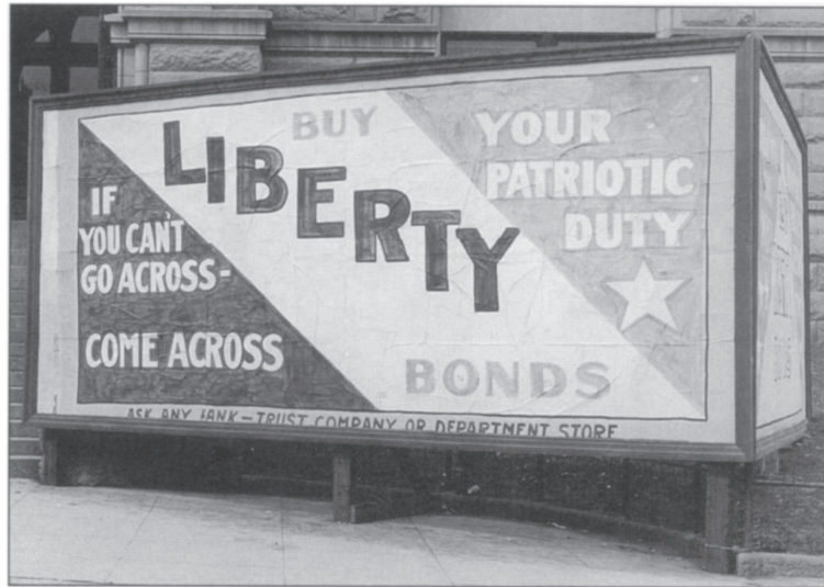
Detail, MHS Photograph Archives, Helena

World War I propaganda revolved around the concept of “100% Americanism,” and ostentatiously buying war bonds was an important component of being a patriot, as were speaking positively about the war, working for the Red Cross, and laboring diligently to provide the nation with essential products. As participants in these activities, Red Lodge’s immigrants were less targeted by zealots than were labor radicals and those who openly criticized the war.