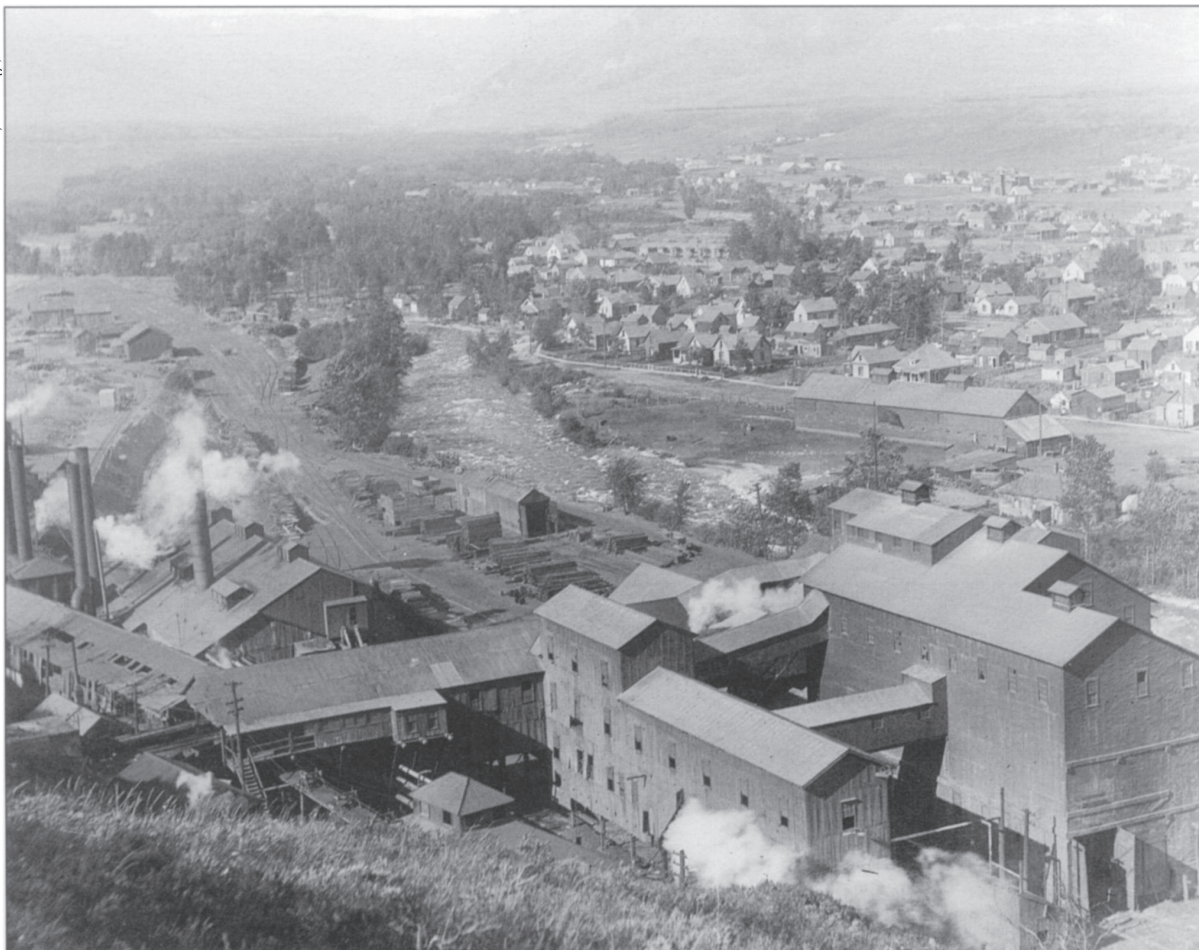
Flash's Studio, Red Lodge, Montana

In 1924 the Northwestern Improvement Company closed down Red Lodge's West Side Mine and the coal metropolis began to shrink. The East Side Mine, pictured below in 1925, held out until the company pulled out of Red Lodge completely in 1932, leaving the coal-mining city in need of a fresh identity and a new economic base.