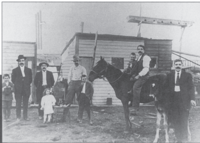
Red Lodge's immigrant communities learned to temper their "foreignness" by engaging in rituals of patriotism such as buying war bonds and participating in Liberty Loan drives and war rallies. At left, the Finnish ladies' band poses in 1907, and above, residents of Little Italy gather in their neighborhood on the northern fringe of Red Lodge.