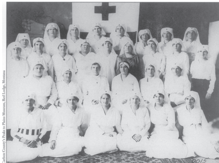
Carbon County's Peaks to Plains Museum, Red Lodge, Montana

Fear compelled Red Lodge's ethnic groups to publicly voice their allegiance to the United States and participate in activities to reinforce and prove their loyalty, but they tended to do so within their own ethnic communities. One such group was the Finnish auxiliary of the Carbon County Red Cross pictured at left.