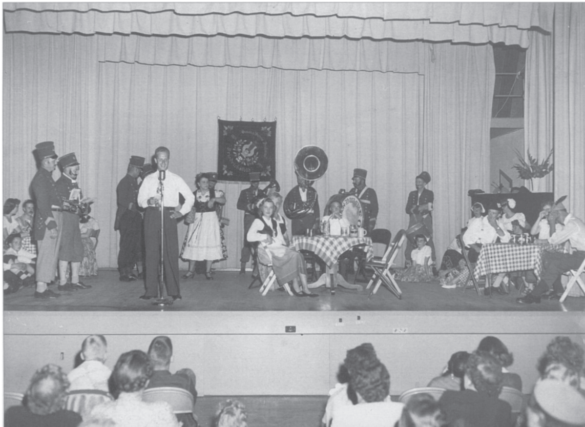
Flash's Studio, Red Lodge, Montana

World War I and Liberty Committee actions jolted members of Red Lodge ethnic groups into acknowledging an American identity and initiating steps toward greater community cooperation. Several multicultural festivals were held in the 1930s, and the Festival of Nations began in 1951. Below is a scene from the German-night program that featured traditional songs and dances.