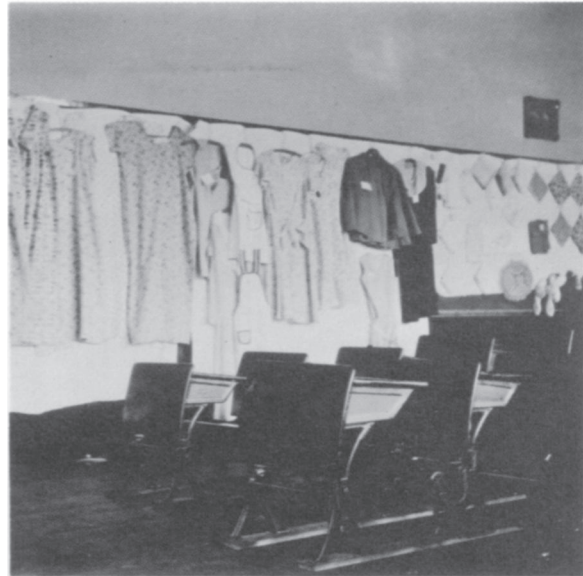
The schoolhouse was always a focus for activities of a rural community. On display at the Springdale School in 1931 is a sewing exhibit.

On the night of the program, Chris had to be pushed bodily outside the curtain of white sheets