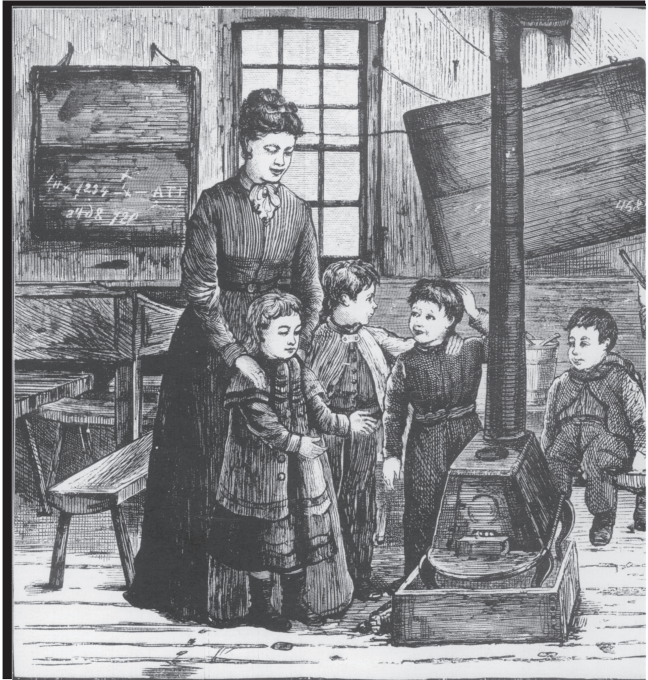
A COLD MORNING IN A COUNTRY SCHOOL HOUSE — Harper's Weekly , 1875