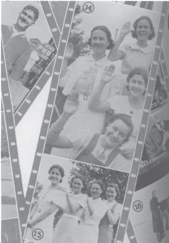
Minot High School Library, Minot, North Dakota