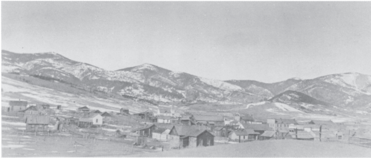
TURN-OF-THE-CENTURY GILT EDGE — huddled at the foot of a rugged mountain