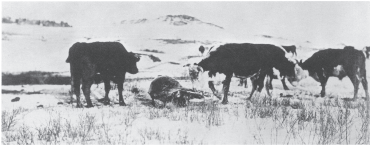
The cattle would just fall from weakness, and die quietly . . .