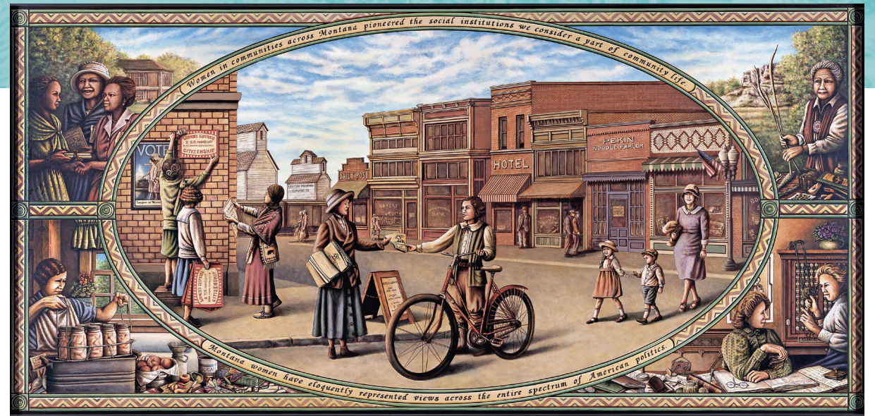
Women Build Montana: Community

The eight vignettes surrounding the two central panels are designed to show Montana women's cultural, social, and economic contributions to their