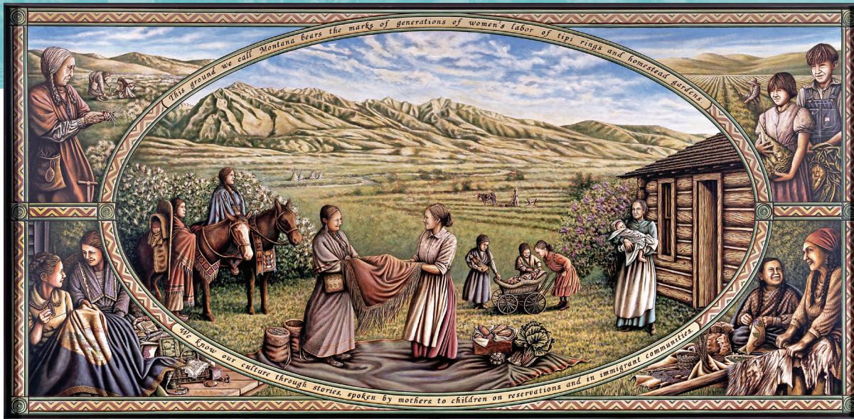
Women Build Montana: Culture

For the Montana Women's Mural project, Ferguson conducted extensive research in collaboration with Montana historians to determine the mural's subjects. Hadley chose to paint two panels to form the mural; each contains a central scene, surrounded by four corner vignettes. The panels, located on the east and west walls of the grand stairway on the third floor of the Capitol beneath the barrel vault, continue the overall theme of art in the statehouse, which tells a narrative of Montana history.