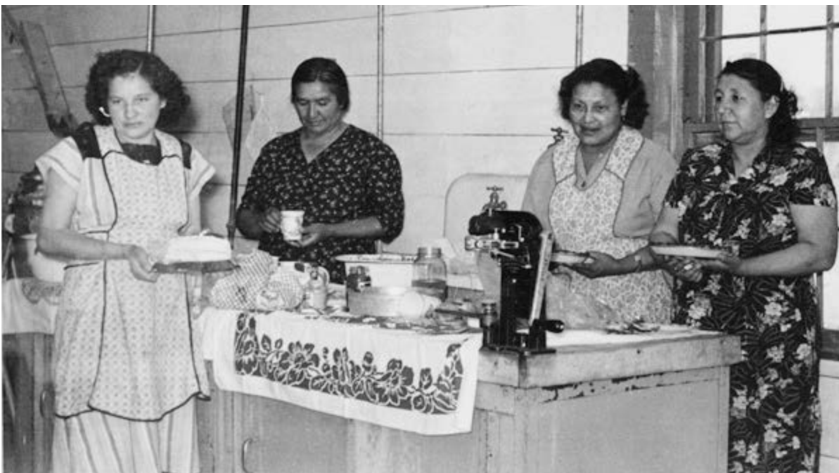
By the late 1950s and early 1960s, Home Demonstration lessons became more focused on nutrition and providing well-balanced meals. On the Fort Peck Reservation, demonstrations were given on the uses of the dry milk, cheese, rice, and cornmeal supplied as government commodities. Here, members of the Fort Peck Friendly Homemakers Club prepare to serve food at a fund-raiser for a children's Christmas party.