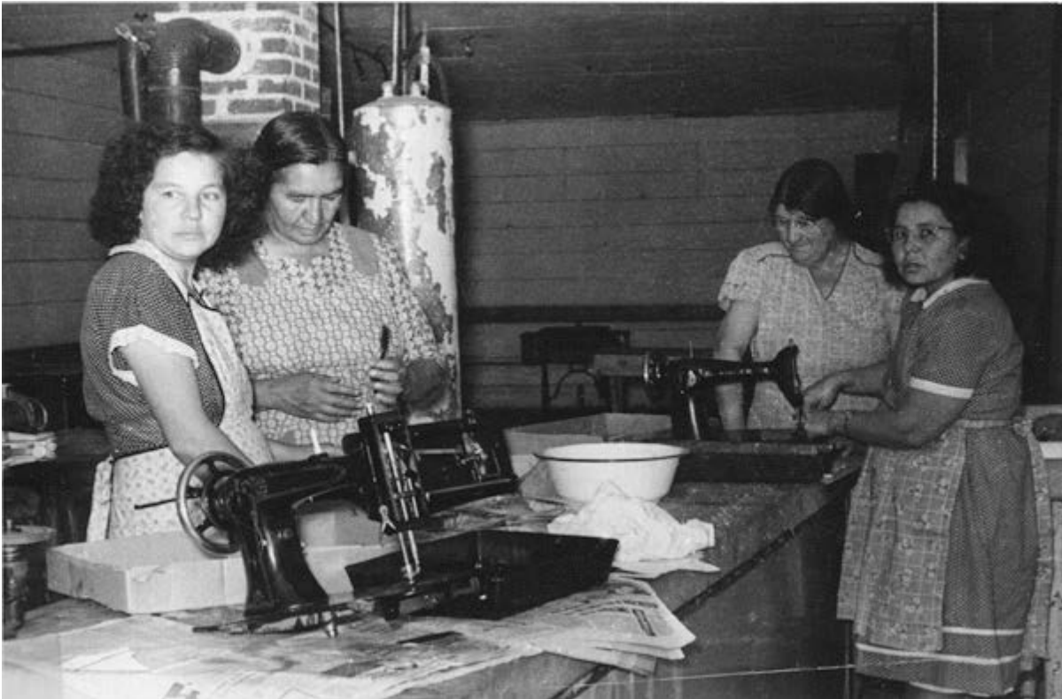
The first Home Demonstration club on the Fort Peck Reservation was formed in the 1940s. By the early 1960s, there were three clubs on the reservation. Above, Wolf Point's Friendly Homemakers participate in a sewing workshop in 1949.

forty, and the final third comprised women over forty. The important thing, according to the agent's annual report that year, "is the fact that many of the new members are younger homemakers. Older women attend club meetings as social members and help take care of the children while the young mothers take part in the club activities." 17