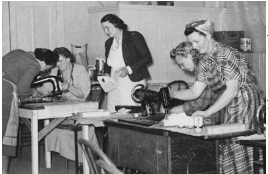
Roosevelt County Extension Service, "Annual Report, 1949," 56

Throughout the postwar years, Home Demonstration agents offered lessons and workshops on the construction of clothing, different types of fabric, maintaining sewing machines, mending, and storing clothes. Right, Froid Homemakers learn to clean and adjust sewing machines at a 1949 workshop.