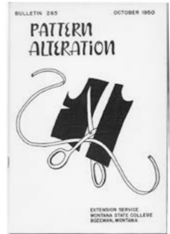
The Extension Service first released the Clothing Construction Handbook in 1940 and Pattern Alteration in 1950 for use by Home Demonstration clubs and workshops. The Extension Service often revised and re-released publications in later years.

ing specialist Lora V. Hilyard commented: “With the cost of living as high as it is, I think we . . . must learn to make some of our own clothing.” Hilyard organized a meeting with ten local merchants to discuss problems with materials. “Some of the results of the meeting included an attempt to clear up the poor thread situation, improvement of the merchant-consumer relationship, especially with regard to returning unsatisfactory goods, and the decision of at least one merchant to stock woolen materials.” Richland County Home Demonstration clubs had a lesson on “Consumer Buying and Clothing” as part of their 1962 and 1963 programs. Merchants from clothing shops in Sidney presented information on “the buying methods of their store and the consumer’s place in the buying picture.” Custer County club members met with local merchants in 1964 to discuss their shopping “gripes,” including the poor quality of ready-made clothing, the lack of variety in clothing choices, and the lack of patterns in larger sizes. 33