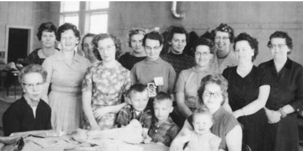
Richland County Extension Service, "Annual Report, 1948"

Membership was often multigenerational, helping to create a community of women. In Richland County in 1946, young women under the age of thirty made up a third of club membership, another third was composed of women between the ages of thirty and