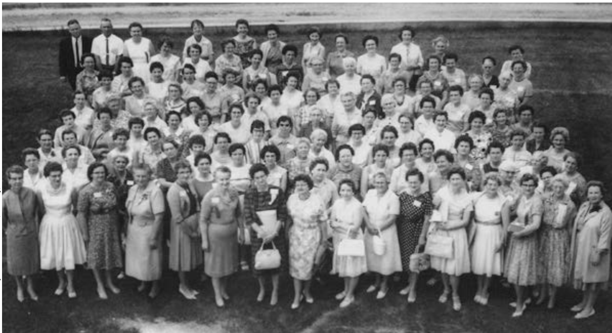
Montana representatives to the State Homemakers Council are pictured above in June 1962. In 1950, there were 566 clubs across the state, and by 1960 that number had increased to 622. In addition to learning skills to create modern homes, raise healthy children, and contribute to their families' economic well-being, club members also appreciated opportunities to build a sense of community and a sense of self-identity.