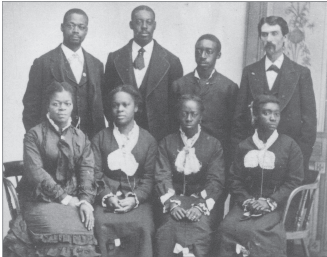
Jubilee Singers of Tennessee, organized in 1870, who toured western areas raising funds for black causes