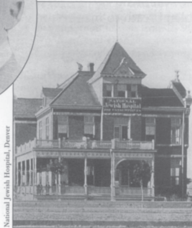
National Jewish Hospital, Denver