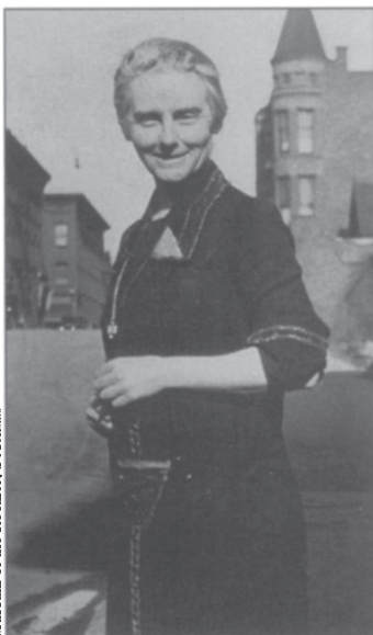
Museum of the Rockies, Bozeman