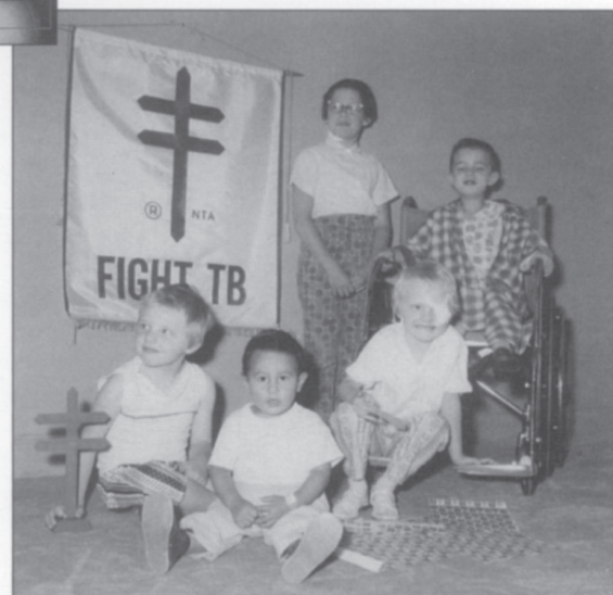
American Lung Association, Helena