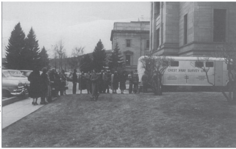
Hoping to make TB a thing of the past, mobile screening units visited Montana communities taking chest x-rays. The unit in the photograph (left) checked the lungs of citizens who gathered next to the capitol in Helena on February 2, 1953.

TB victim, had been a patient at Galen for ten months in the 1920s. 40