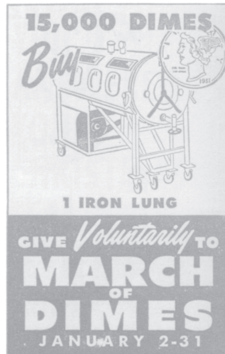
Montana Health, 7 (January-February 1952), p. 2