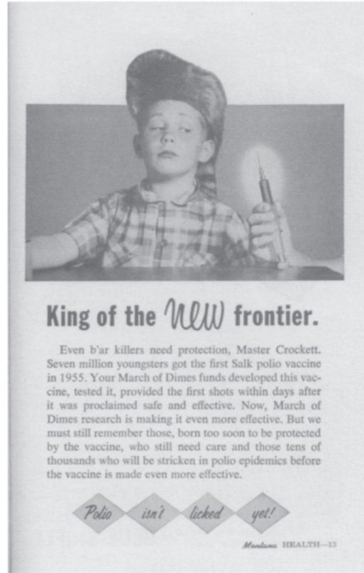
Montana Health, 11 (January-February 1956), p. 13

In 1954 the first polio vaccine, a killed-virus vaccine developed by Jonas Salk, was tested in a series of field trials. Over two hundred thousand American children received the Salk vaccination and as many more were given a placebo. In Montana 3,130 children in Gallatin, Mineral, Missoula, and Park Counties took part in the field trials. Few complications arose in the vaccinated children, and immunization programs began in earnest in 1955. The polio vaccination could not have come at a more propitious time: Montana reported over 100 polio cases annually between 1950 and 1954. Given that both private and