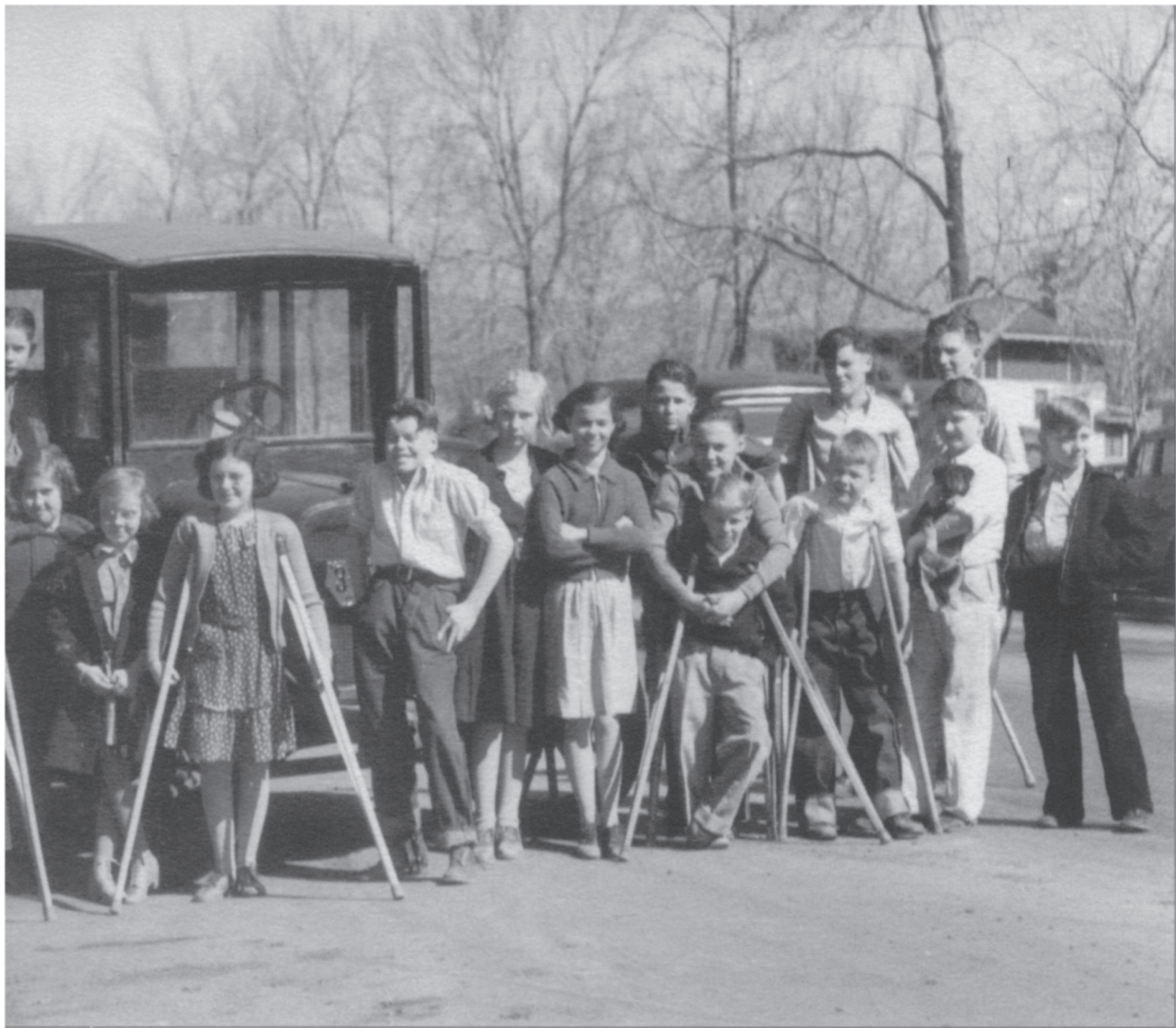
St. Vincent Hospital, Billings, Montana

Montana, and a graduate of Rush Medical College in Chicago who had returned to the state in 1914 after completing postgraduate training in orthopedics. 15